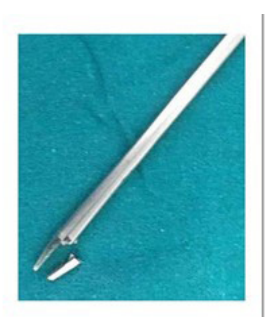
Fig. 3: Bigger size pituitary rongeur which was used to remove the metallic foreign body and 2mm size pituitary rongeur whose tip was broken

continuous irrigation and backflow of normal saline it migrated laterally and posteriorly towards the lateral recess. So, under