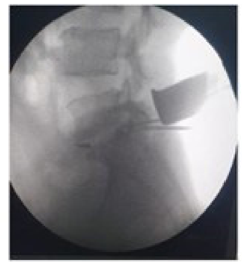
Fig. 1: Retained broken pituitary rongeur tip which migrated anteriorly while trying to remove